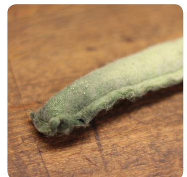
Worn out receiver dryer (or desiccant bag cartridge) often results in clogging of the condenser's inner tube