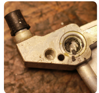
Visible soiling at the condenser inlet